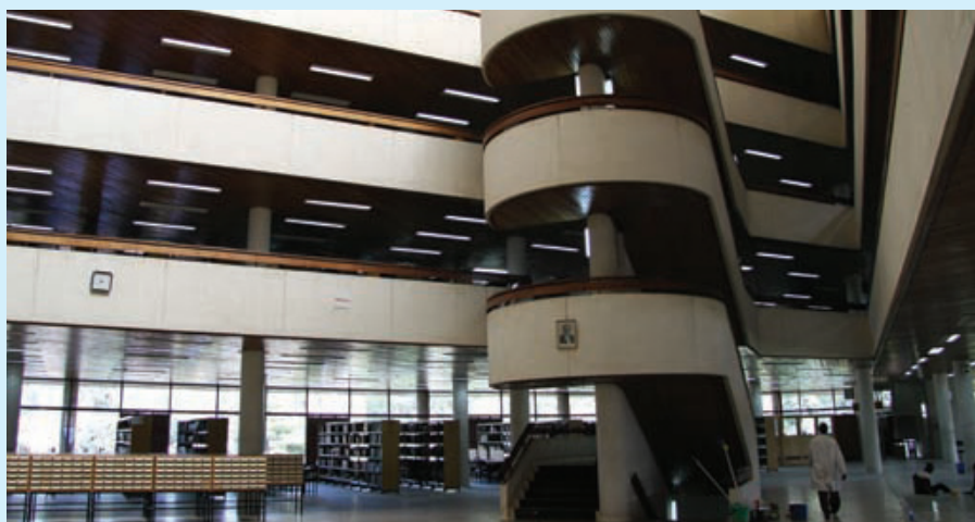
An inside view of JKML Library