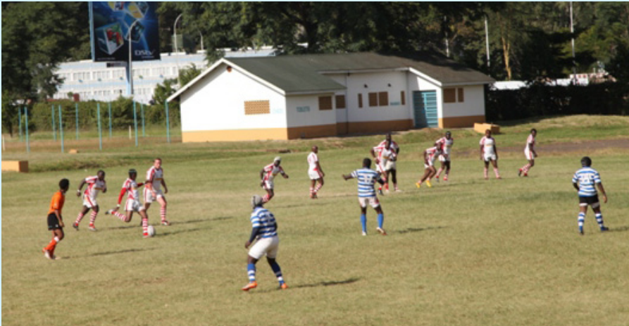
The Mean-Machine University of Nairobi Rugby Team

Currently, most of University of Nairobi teams are playing at the National level. In particular Rugby (Mean Machine), Basketball, (Terrorists and Dynamites), Volleyball, Hockey, Handball and soccer are registered and playing in the National League series. Among the key achievements by University of Nairobi teams are: