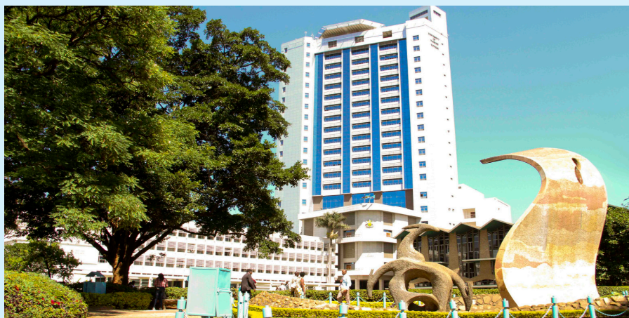
The University of Nairobi Towers at the Main Campus