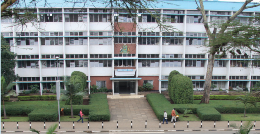
School of Engineering

As an institution, it focuses on community empowerment and service to bring about transformational leadership for sustainable environmental management of our natural resources. It seeks to embrace the ideals and works of the Nobel Peace Laureate, Prof. Wangari Muta Maathai and the Green Belt Movement (GBM) which offer practical applications of holistic inter-disciplinary knowledge to build capacities at local, national and continental levels.