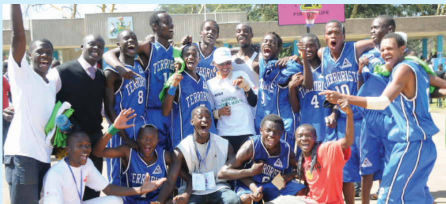
University of Nairobi Basketball Team