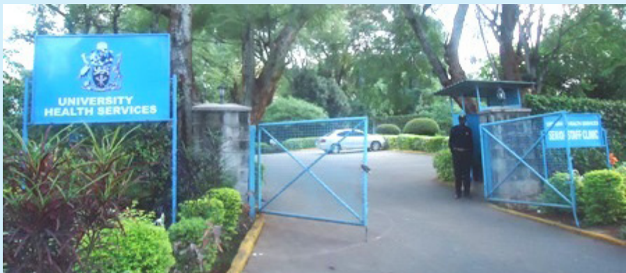
The entrance to the University of Nairobi Health Services Clinic along State House Road

The maternity care provided will exclude delivery, pregnancy related complications and services received from private facilities.