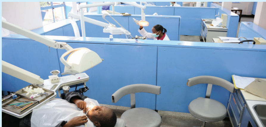
Patients being attended to at the School of Dental Sciences

This is a multidisciplinary research center based in the Department of Pharmacology & Pharmacognosy. Its aim is to carry out Phytochemical, Pharmacological, Toxicological and Microbiological studies of medicinal plants, especially traditional herbal remedies for human and veterinary use.