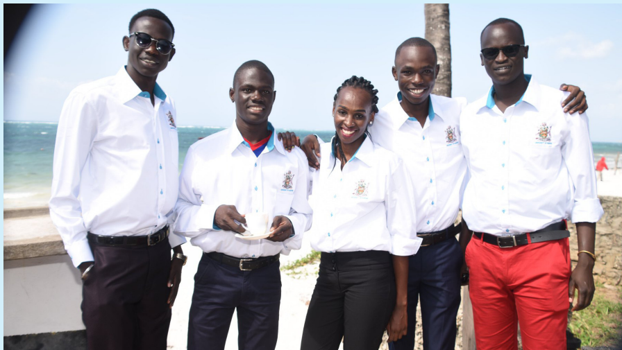
A section of the 2019 Students Organization Leaders (UNSA)

Students are encouraged to participate in extra-curricular activities while at the University. One such outlet is participation in professional associations and clubs. These associations not only address the professional and personal welfare interests of students, but they also provide opportunities for performing community service and personal development. The University has various students bodies, which represent students' interests. Through the various representatives, students access all decision-making levels from the halls, the Senate, and all the way to Council. The University of Nairobi is committed to seeing that student organizations are fiscally able to meet their desired goals and aims. Student Organizations should liaise with Deans of Faculties and Directors of Institutes for further guidance.