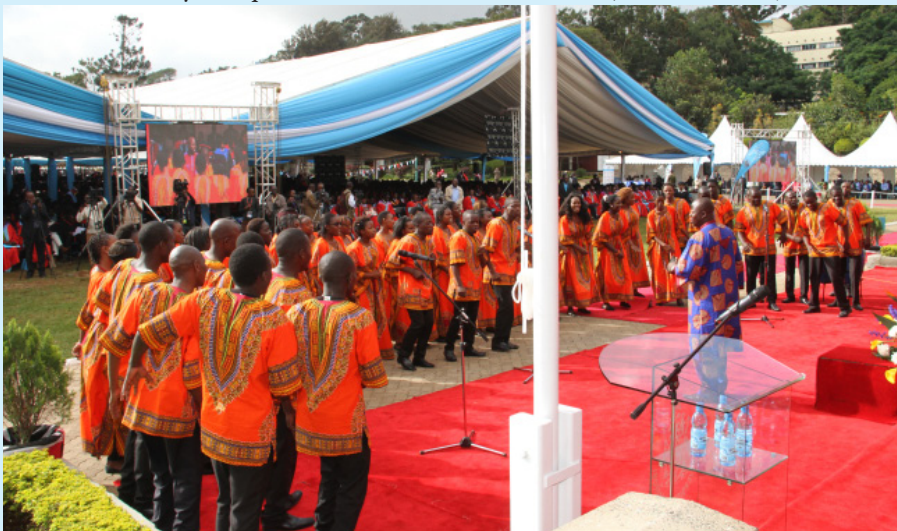
University of Nairobi choir performing during the 56th Graduation Ceremony

Habitat for Humanity Kenya - University of Nairobi Campus Chapter Hindu Students Association Historical Association of Kenya Human Resources Management Students Association Inter-College Environmental Network International Relief Friendship Foundation (IRFF) Japan-Kenya Student Conference of Nairobi Kenya Law Students' Society Kikuyu Kiswahili Club (CHAKIKU) L'afreme - Medical Campus Linguistics Student Society Lions Club of the University of Nairobi Literature Students Association Marketing Students Association Mathematics Association of Nairobi University (MANU) Medical Students Against AIDS Muslim Students Association-E-Mail: msa_un@yahoo.com Nairobi University Actuarial Students Association Nairobi University Agriculture Students Association Nairobi University Association for a Drug Free Society -(NUADS 72 Nairobi University Biochemistry Students Association (NUBSA) Nairobi University Chemical Club Nairobi University Collegiate Association for Research of Principle Nairobi University Computer Science Students Association (NUCOMMSA)