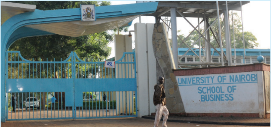
School of Business (Lower Kabete Campus)