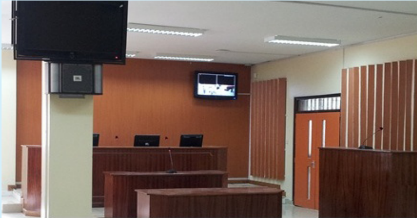
State-of-the-Art Moot Court Facility at the School of Law.