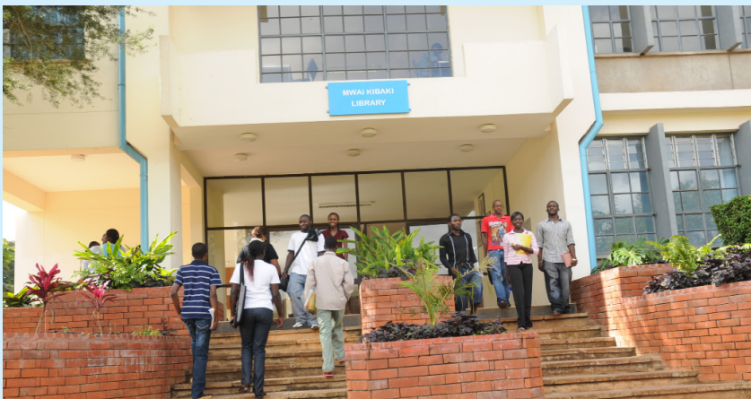
The Mwai Kibaki Library at the Lower Kabete Campus