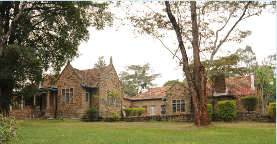
Grogon house a protected colonial monument under the care of the University of Nairobi Chiromo Campus