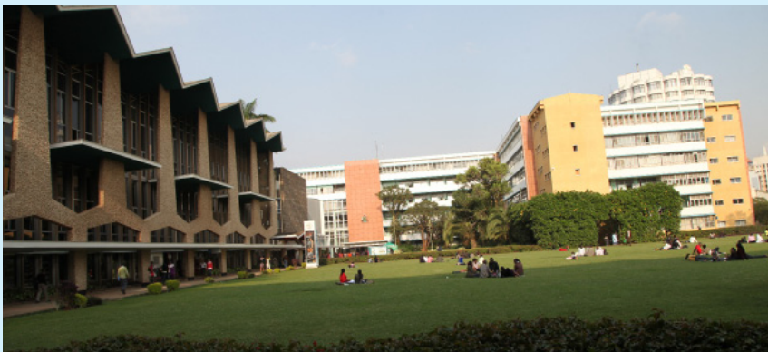
A view of the University of Nairobi Main Campus

Nairobi enjoys a temperate climate. The hottest periods, however, occur between January and March and August and October with the coolest period in July. The long rains fall from the end of March to the end of May while the short rains are experienced from the end of October to December. The average annual rainfall is about 800 centimetres. Nairobi is the capital city and the commercial, administrative and cultural centre of Kenya. In Nairobi are found the Parliament Buildings, Headquarters of Government Ministries and Departments. Also, the city is home to the City Hall, State House, National Museums of Kenya, Snake Park, the Arboretum, The Animal Orphanage, churches of various denominations, Mosques, Hospitals, Markets, Art Galleries, Kenyatta International Conference Centre (which houses one of the largest Conference Halls in the world), cinemas, numerous hotels, restaurants, entertainment centres and even a game park. Transportation around Nairobi and its environs is easily available.